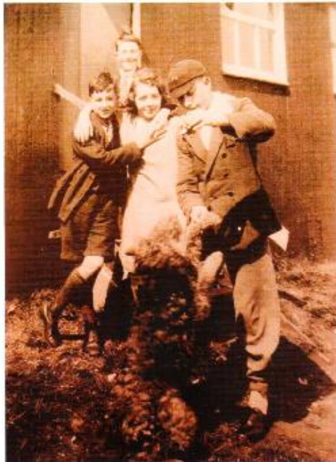
Taken at Hillside Holiday Camp, Knockaloe (approx. 1932)