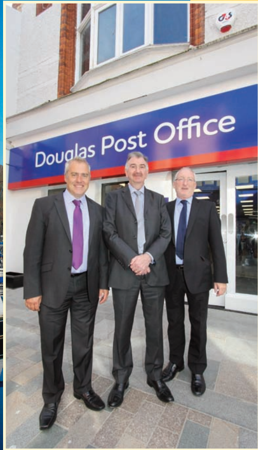
Relocation of Douglas Post Office