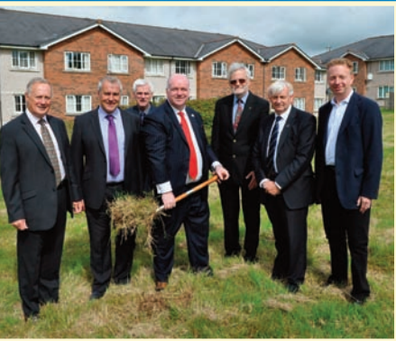
Work starting on the new nurses' block.