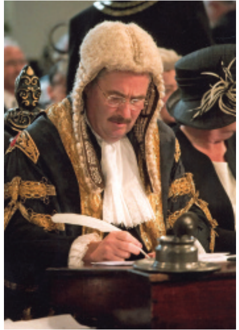
The President (left) and the Speaker (right) Captioning the Acts.