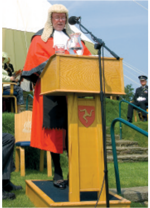
The First Deemster Promulgating the Laws

(Almighty God, from whom all thoughts of truth and peace proceed: kindle, we pray thee, in the hearts of all people, the true love of peace; and guide with thy pure and peaceable wisdom those who take counsel for the nations of the earth; that in tranquillity thy Kingdom may go forward till the earth is filled with the knowledge of thy love. Through Jesus Christ our Lord. Amen.)