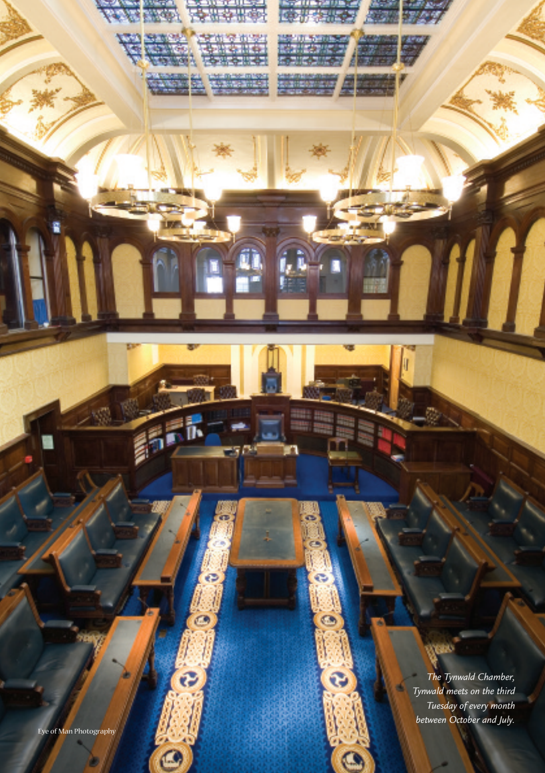
The Tynwald Chamber, Tynwald meets on the third Tuesday of every month between October and July.