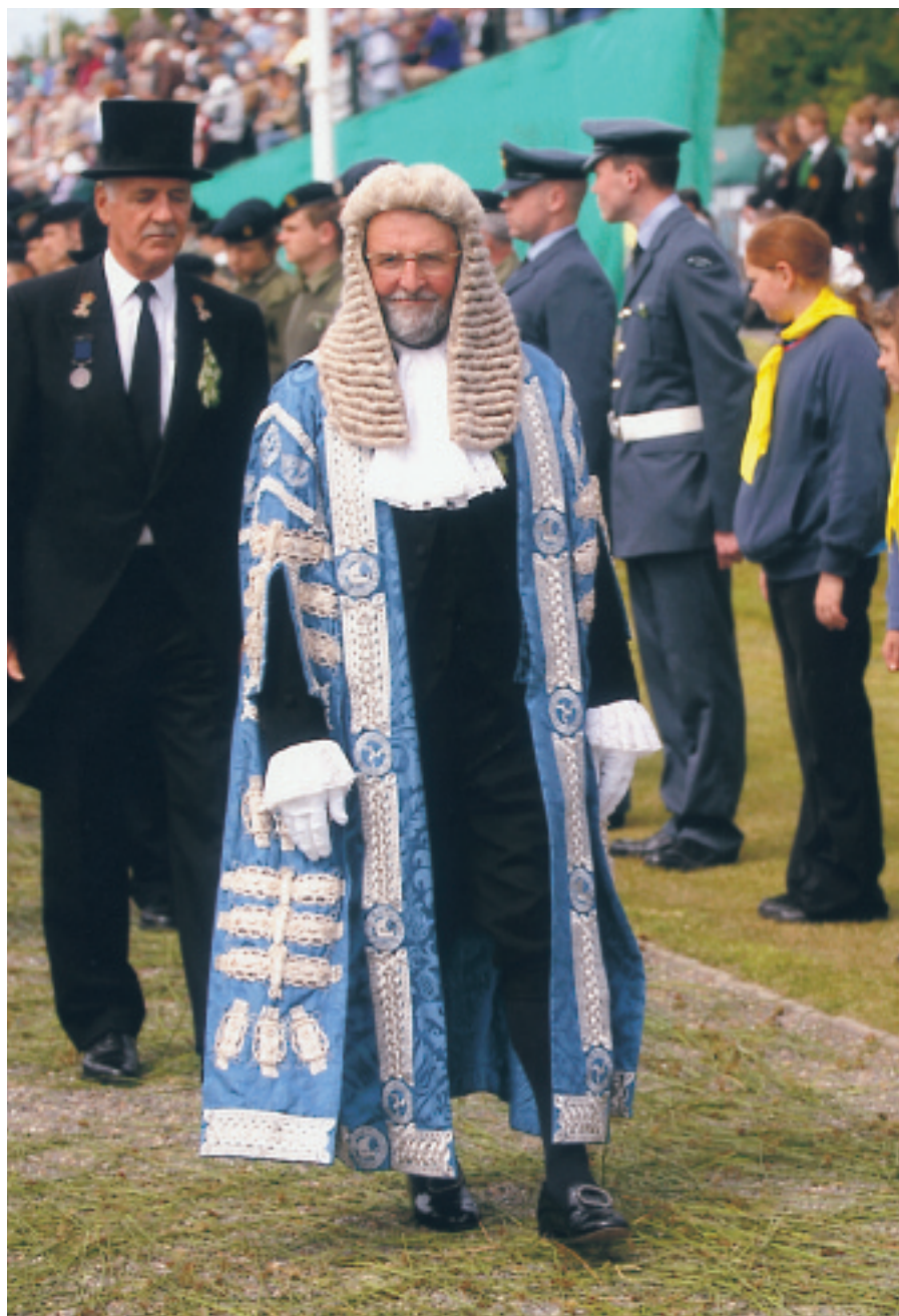
The Hon. Noel Q. Cringle OBE, President of Tynwald