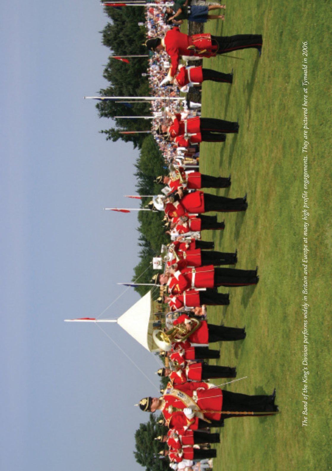
The Band of the King's Division performs widely in Britain and Europe at many high profile engagements. They are pictured here at Tynwald in 2006.