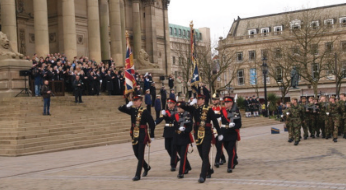
The Guard of Honour is provided by the Duke of Lancaster Regiment.

Memorial, they halt and take up an alignment on either side of the path facing inwards so as to enable His Excellency to pass through and be the first to step on to Tynwald Hill.